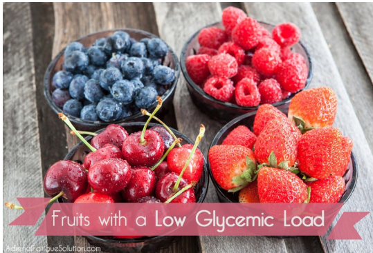
Fruits with a Low Glycemic Load